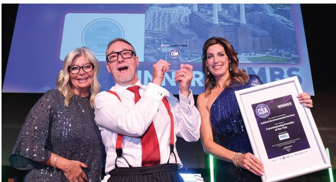
Ashford Environmental Services

Commissioning Manager of the Year Sponsored by HDR