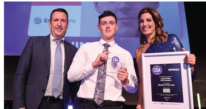
HDR – The Careers Plus Programme