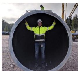
The site as it is today. It all started 2018 with a new sea water pipe installation to secure sea water cooling for the LPP eastern campus.

ZRH11 Data Centre Zurich, Switzerland is part of the Vantage Data Centres Zurich Campus Winterthur Switzerland, the first for the US-based client. Built by DPR Construction, our client is Zauner Anlagentechnik GmbH. The 3 storey ZRH11 facility is the first building with a total of 8MW via a more standard engineering solution of chillers (11no.) and Heat pumps (2no.) serving the data hall requirements via CRAC units (30no.) and FCUs (30no.). Standard air conditioning is provided for offices and ancillary areas via AHUs, CAV supply and extract boxes and grilles/diffusers. The overall data centre campus (ZRH1) will total 40MW once fully developed.