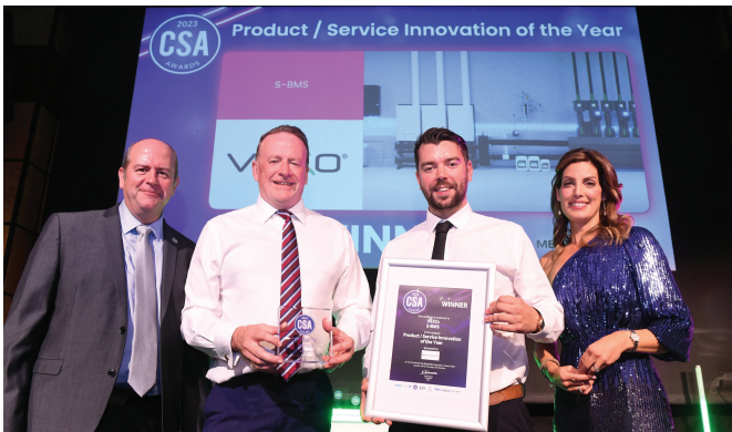
VEXO – S-BMS

Commissioning Provider of the Year Sponsored by Modern Building Services