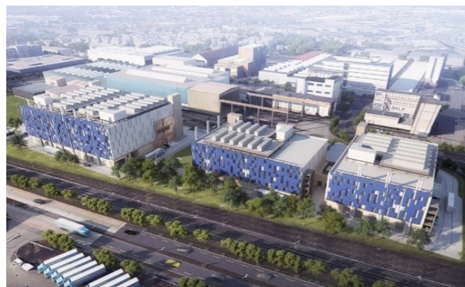
How the Vantage Data Centre Campus will eventually look.

ZRH11 Data Centre Zurich, Switzerland is part of the Vantage Data Centres Zurich Campus Winterthur Switzerland, the first for the US-based client. Built by DPR Construction, our client is Zauner Anlagentechnik GmbH. The 3 storey ZRH11 facility is the first building with a total of 8MW via a more standard engineering solution of chillers (11no.) and Heat pumps (2no.) serving the data hall requirements via CRAC units (30no.) and FCUs (30no.). Standard air conditioning is provided for offices and ancillary areas via AHUs, CAV supply and extract boxes and grilles/diffusers. The overall data centre campus (ZRH1) will total 40MW once fully developed.