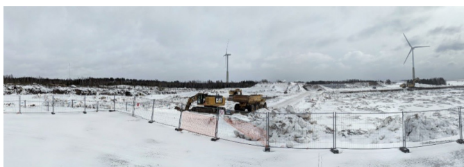
The site before works commenced.

LPP5A in Hamina Finland is part of a 2-billion-dollar investment by Google who bought the Summa Mill from the Finnish Paper Company in 2009. Ashford are undertaking the works for Austrian engineering company Zauner Anlagentechnik GmbH. The first phase of the project was completed in 2011 and 2020 saw continued investment with LPP5A being built. The advanced cooling system uses seawater from the Bay of Finland reducing energy use and is the first of its kind anywhere in the world.