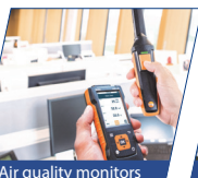
Air quality monitors