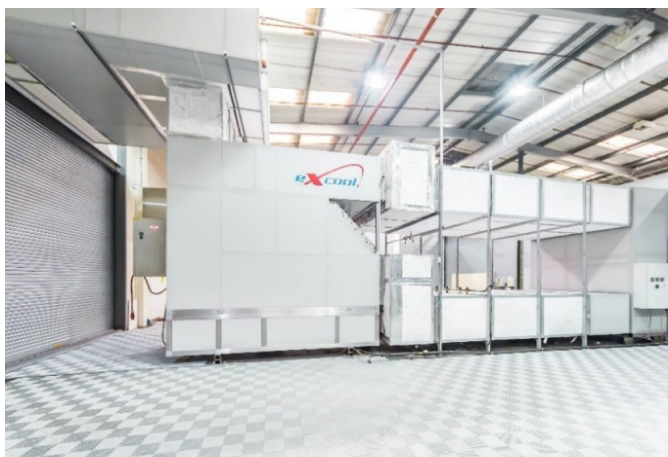
The “Excool” Indirect Evaporative Data Centre Cooling unit

The system uses free cooling in the Winter, adiabatically cooled outside air in the Summer and is “topped up” by mechanical refrigeration on extreme days. The data centre also utilises 52 CRAC units over two floors served via traditional refrigeration.